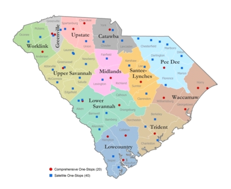
Map 1.2: Local Workforce Areas and One-Stop Career Centers in South Carolina

In program years 2009-2010 and 2010-2011, South Carolina received a federal WIA allocation of $118 million plus $60 million in federal stimulus funds, for a total of $178 million. This program does not receive a matching state appropriation.